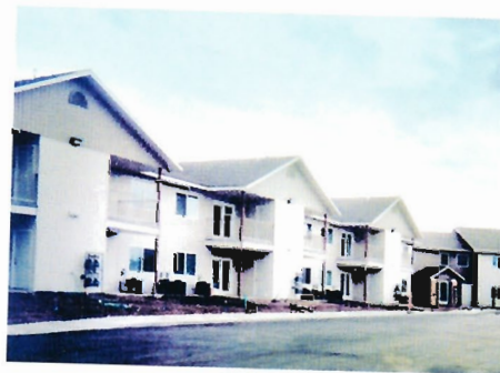
Rosslare Senior Apartments in Idaho Falls

A combination of Low-Income Housing Tax Credits, HOME funding, and an IHFA loan funded this development.