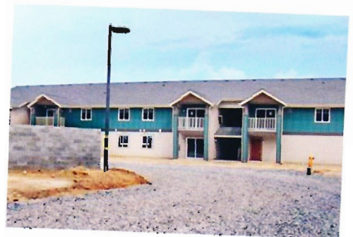
Ponderosa in Sandpoint